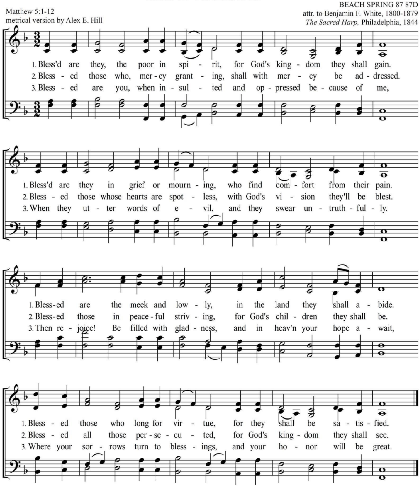
© 2021 by Alex E. Hill. All rights reserved.